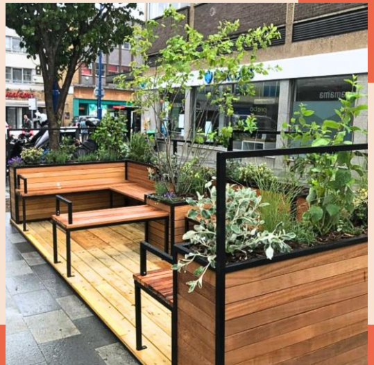
An example of a Parklet